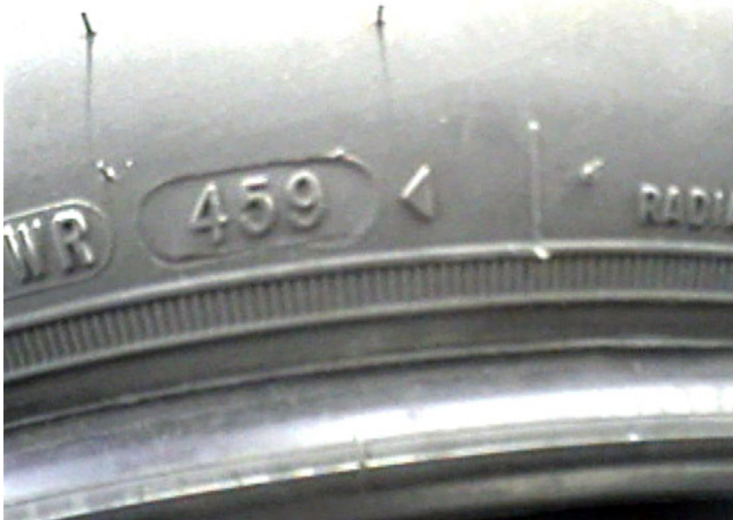
In San Francisco, KGO's reporters found a nine-year-old tire, made in the 45th week of 1999, sold as new at a tire dealer.